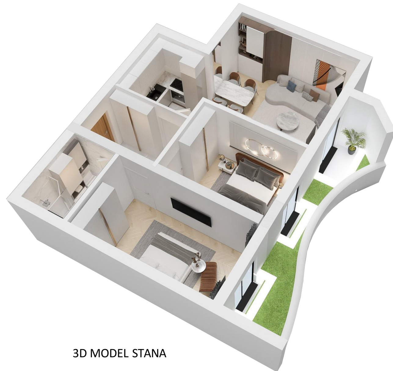
3D MODEL STANA

- OSNOVA TIPSKE ETAZE I-IX SPRATA - Stanovi: 1, 16, 31, 46, 61,76,91,106, 121.